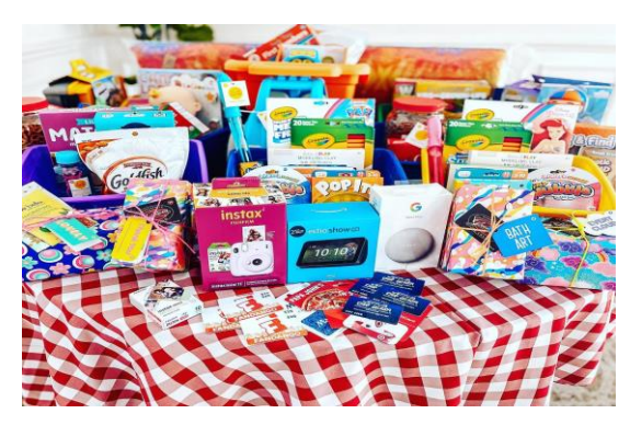
Back to School Bash