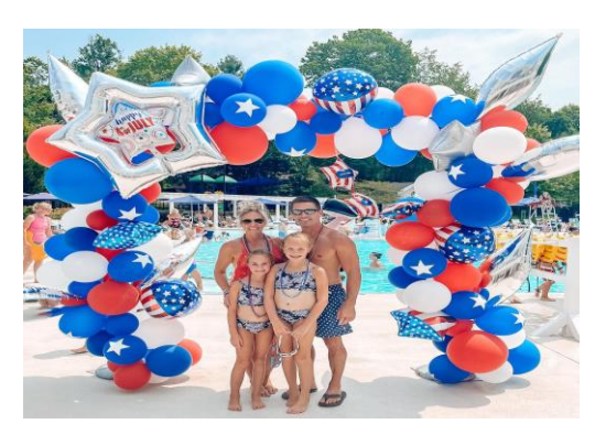
4th of July