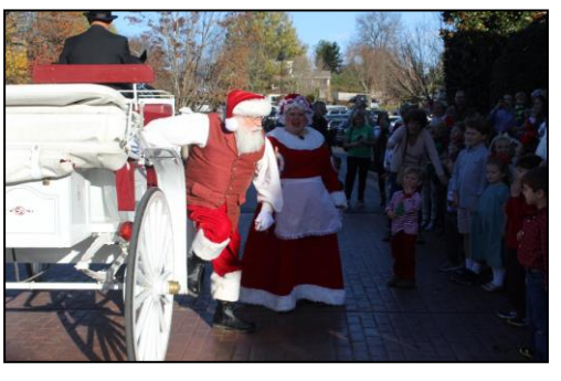
Cookies with Santa